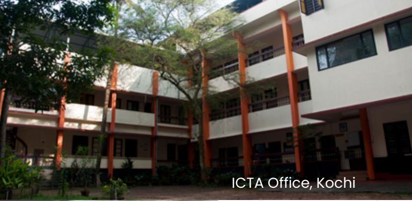
ICTA Office, Kochi