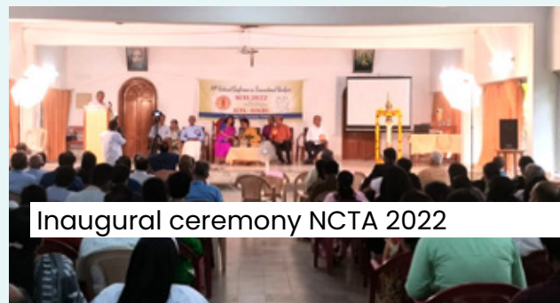
Inaugural ceremony NCTA 2022