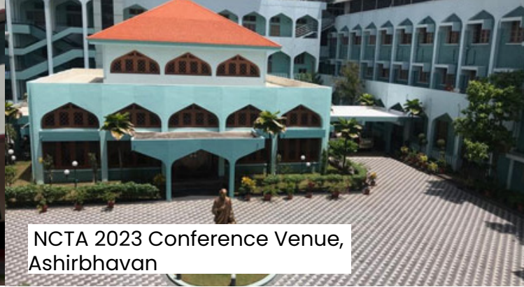
NCTA 2023 Conference Venue, Ashirbhavan